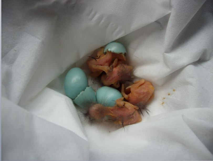
Hatching black redstarts