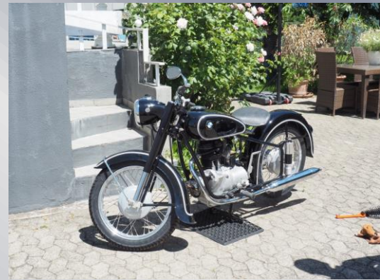
Restoring old motorbikes – here BMW R25/3 1954

Try us – any free capacity usually fills very fast.